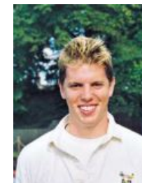
Klaas Jan Huntelaar (AC Milan footballer)