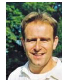
Gordon Ramsay (Famous Chef)