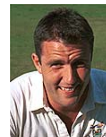
Pat Cash (Former Tennis player)